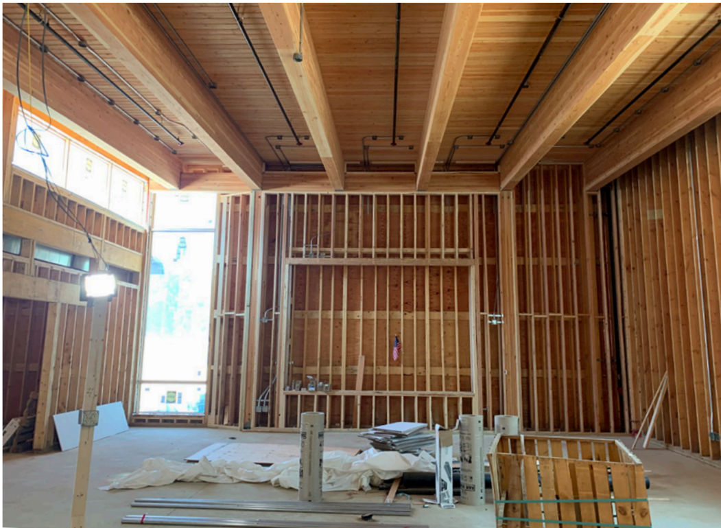
Above Adult's Reading Room Left Meeting Room