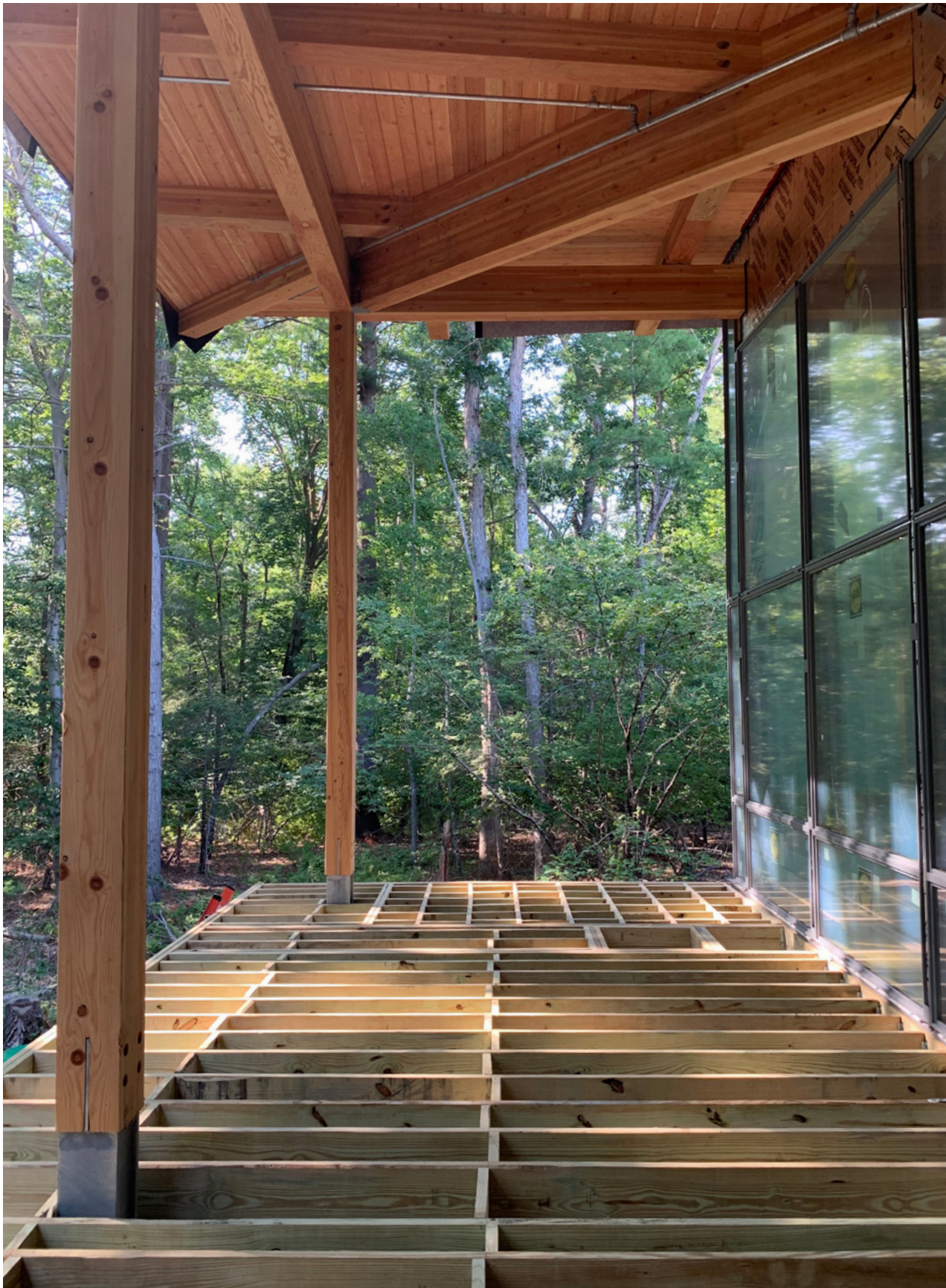
Above Adult's Porch