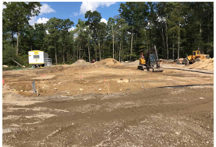
Top Building Entry Courtyard Left Teen's Window Above Parking Lot Grading Work