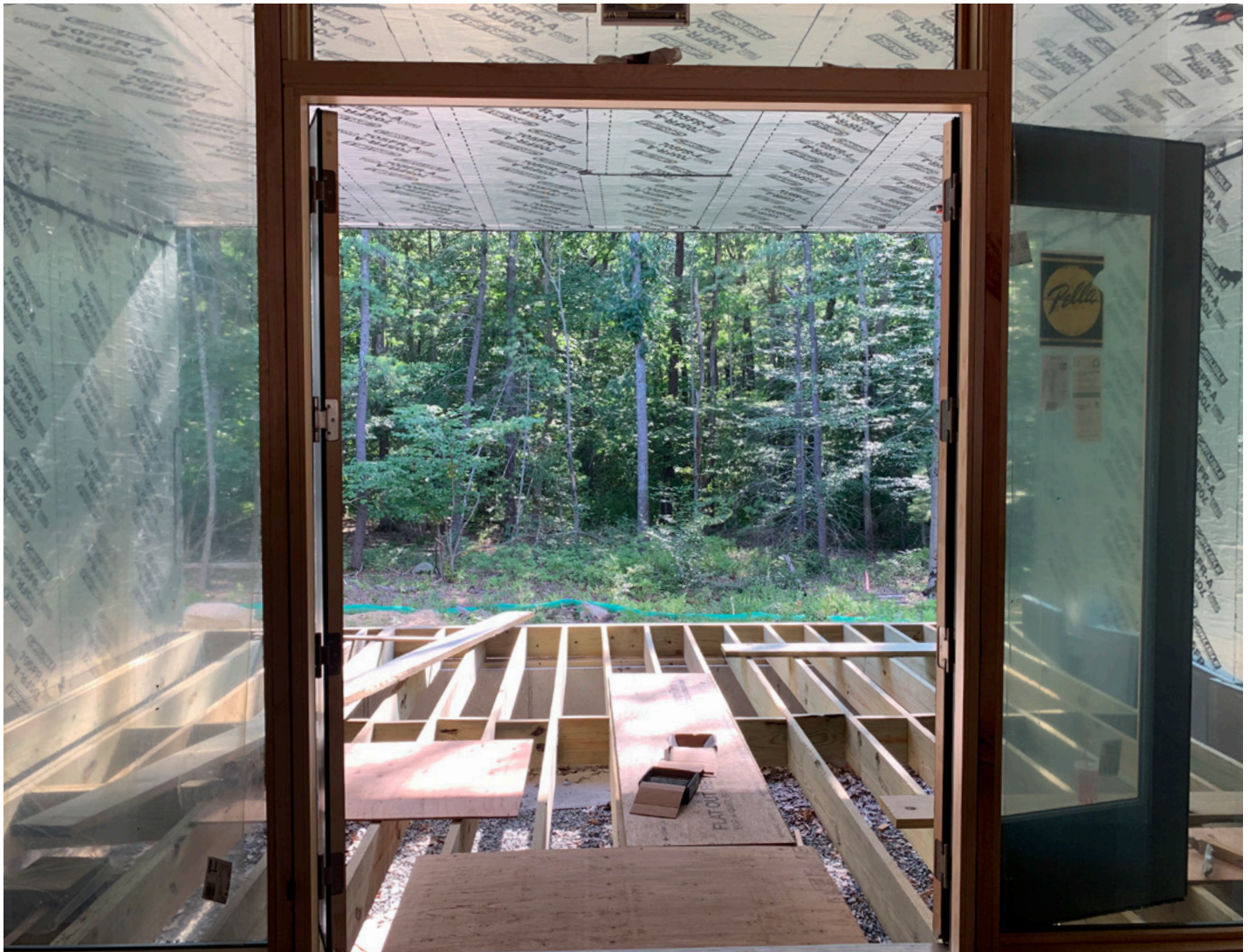
Above Periodical's Screened Porch Right Adult's Reading Room