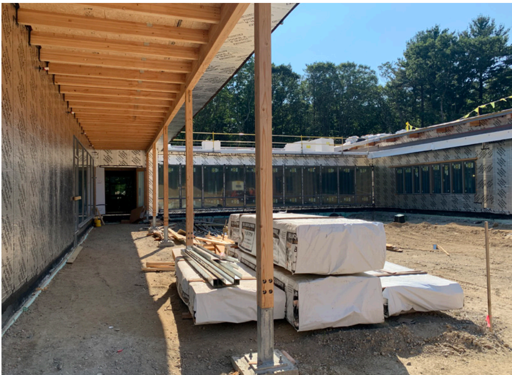
Above Adult's Porch Left Entry Canopy