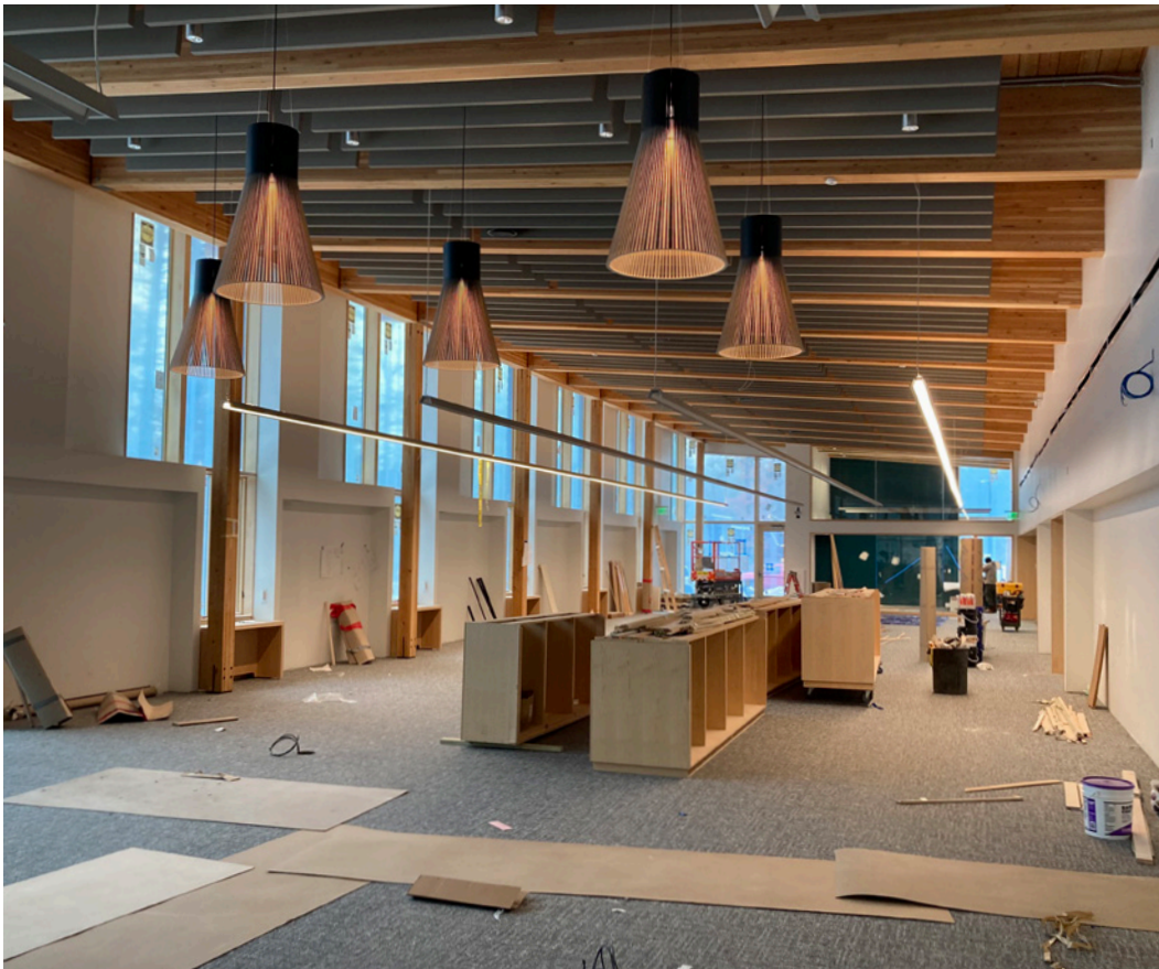
Above Adult's Reading Room Left Adult's Reading Room