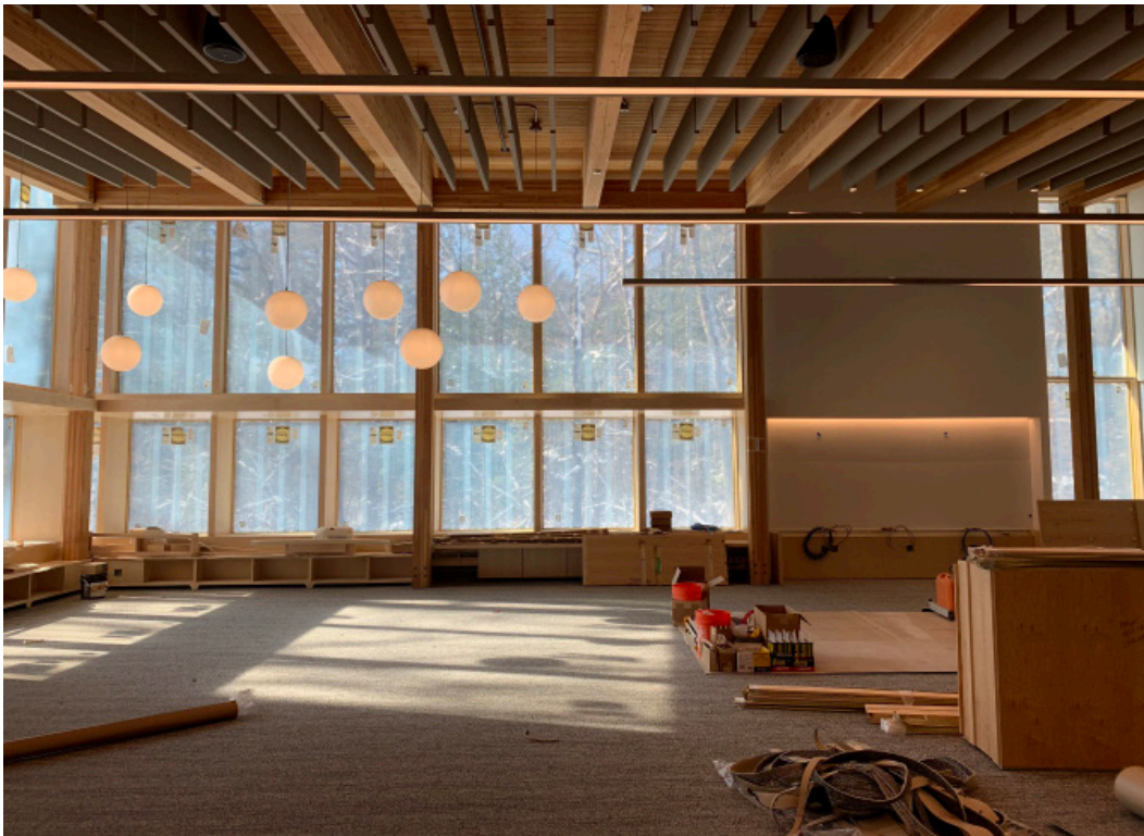
Above Children's Reading Room Left Children's Window Seating