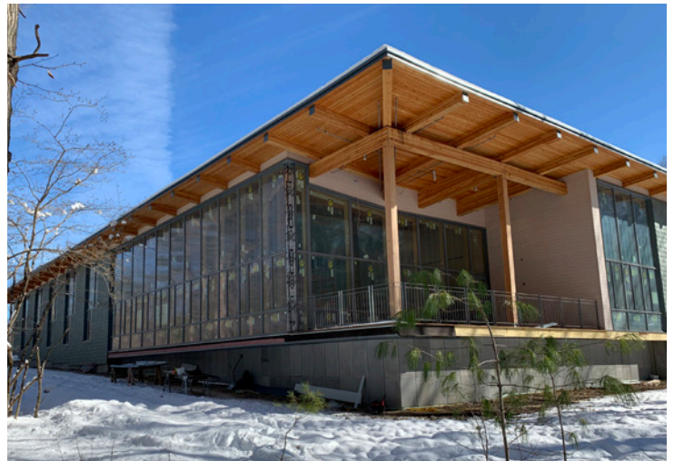
Top Building Entry Courtyard Left Adult's Study Carol Windows Above Parking Lot