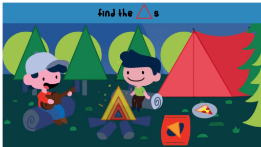
A Camping We Will Go from The Kiboomers