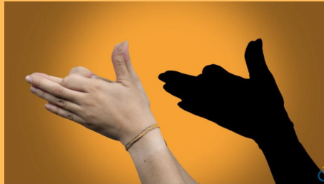
How To Make Shadow Animals With Your Hands

Use a flashlight and form your hands into the shadow of animals you might encounter while camping!