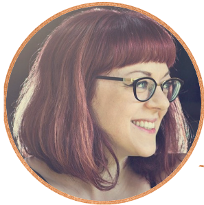
V. E. SCHWAB

VICTORIA “V. E.” SCHWAB is the #1 New York Times bestselling author of more than twenty books, including the acclaimed Shades of Magic series, Villains series, Monsters of Verity duology, Cassidy Blake series and The Invisible Life of Addie LaRue . Her work has received critical acclaim and been featured in the New York Times , Entertainment Weekly , Washington Post and more, translated into more than two dozen languages, and has been optioned for television and film. When she’s not haunting Paris streets or trudging up English hillsides, she lives in Edinburgh, Scotland, and is usually tucked in the corner of a coffee shop, dreaming up monsters.