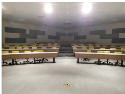
View of seats from theater stage

Bookable: During business hours Max bookings per month: 2 Max hours per booking: 6 Max bookings per day: 1