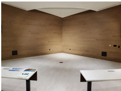
View of stage from theater seats

Furniture is permanently set up and may not be rearranged