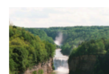
NYS Empire Pass