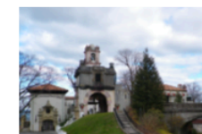
Vanderbilt Museum & Planetarium