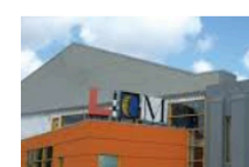
Long Island Children's Museum