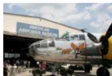
American Airpower Museum