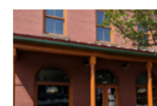
Long Island Explorium