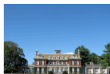
Old Westbury Gardens