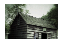
Old Bethpage Village Restoration