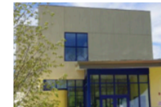
Children's Museum of the East End