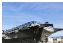
Intrepid Sea, Air & Space Museum