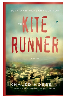
Kite Runner by Khaled Hosseini

Christie Book Club Meeting Tues., JAN. 27th | 11:00am 1207 Hwy. 518, Seguin