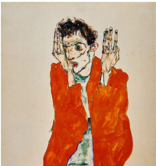
EGON SCHIELE (1890-1918) SELBSTDARSTELLUNG MIT ORANGEFARBENEM UMHANG (SELF-PORTRAIT WITH ORANGE CAPE)

Sponsored by the Friends of the Pennington Public Library and the Hopewell Valley Arts Council